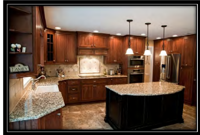
One of DCD's latest transformations

*For a lighter twist: use skim milk, lite Cool Whip, reduced fat Oreos, & Sugar Free JELL-O Chocolate Instant Pudding